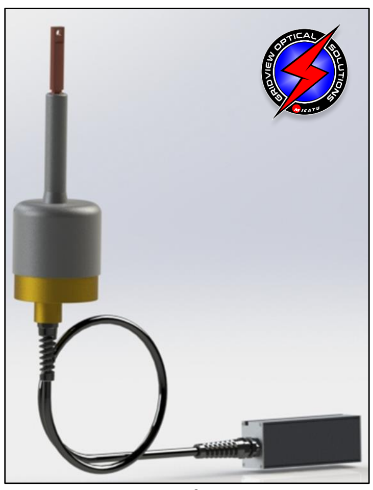
Specifications: GridView™ Re120 Sensor

The GridView™ Deadbreak Elbow Adaptor Sensor provides both high accuracy and precision that remains constant regardless of applied voltage. Average accuracy is ±0.15% from 1% of nominal operational temperatures of 21°C (70°F) and ±0.5% within a temperature range of -30°C(-22°F) to 70°C(158°F).